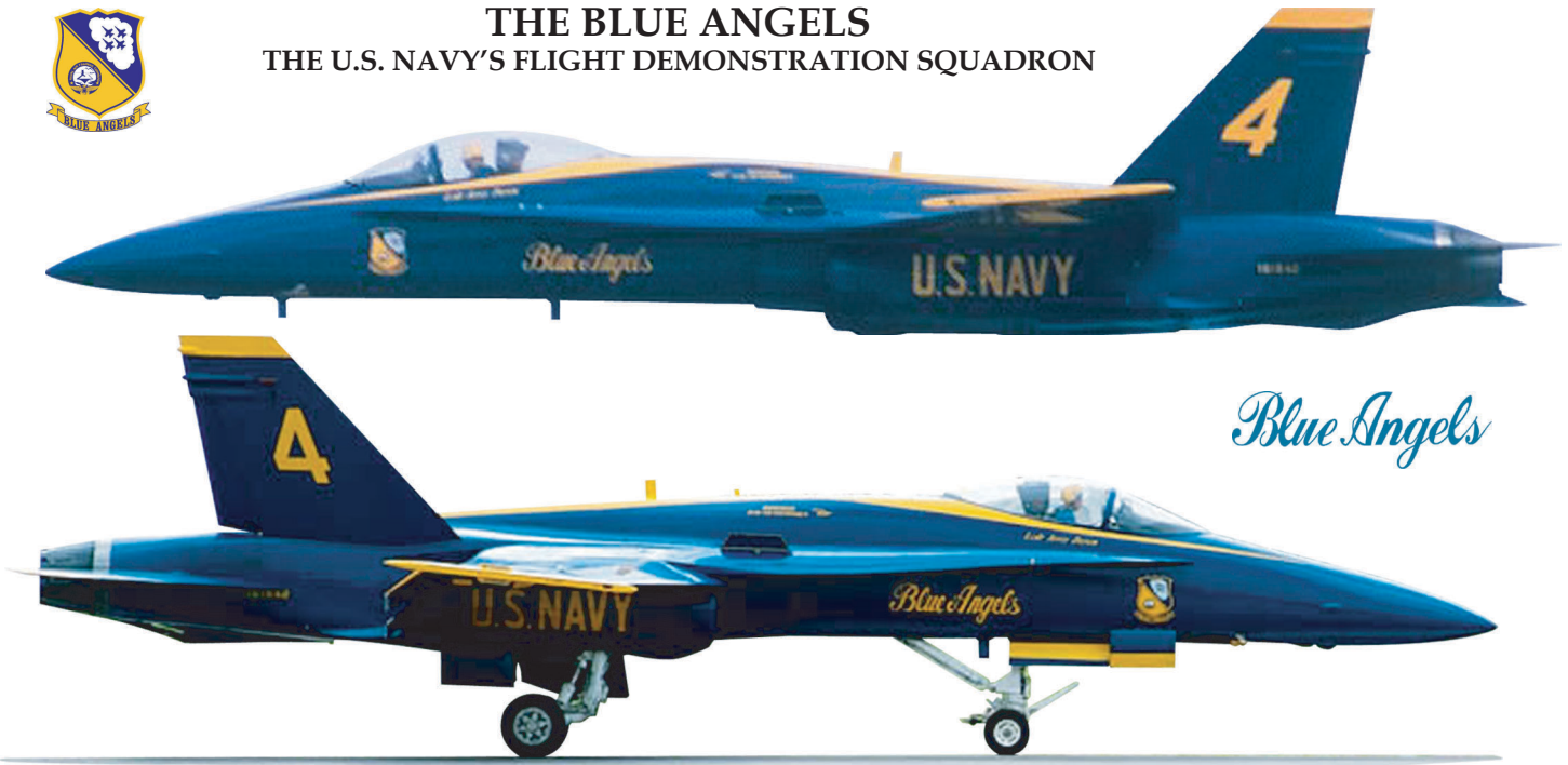
MCDONNELL - BOEING F/A-18-A "HORNET"